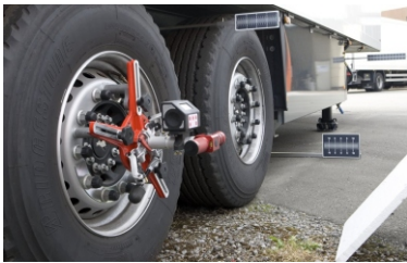
Upgrade Kit for trailer and semi-trailer