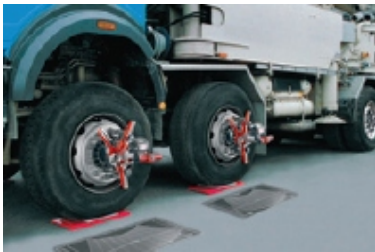
Upgrade Kit for vehicles with multiple steering axles