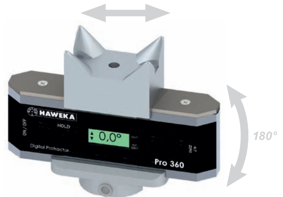
The crown adapter can be moved laterally. Double-sided application area, 2 position adapters available (rotatable by 180°).

The device enables measurement of the inclination angle of the transverse control arm or the drive shaft to the horizontal. The measured values can be used as further input in electronic axle alignment systems and are important for correct setting of the camber, toe and castor.