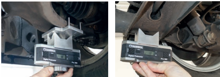
Application examples (measuring adapter ③ and crown adapter ①)